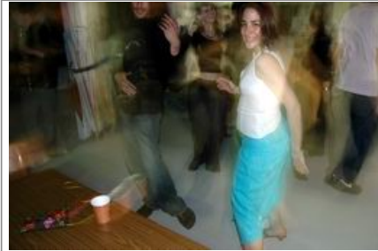
the band wouldn't stop, so we kept dancing till next day