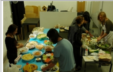
thanks to everyone who contributed with food and the preparation!!